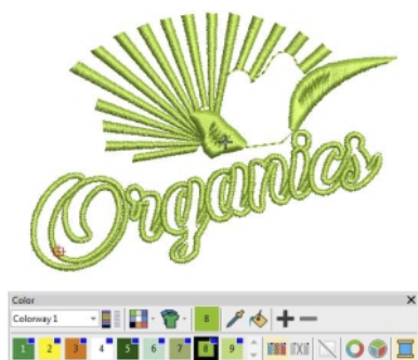
Preview design elements by selected color

Preview design elements using a particular thread by holding down the mouse on a particular thread palette color.