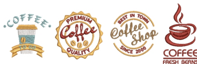
New editable design templates

Enjoy a collection of new editable design templates.